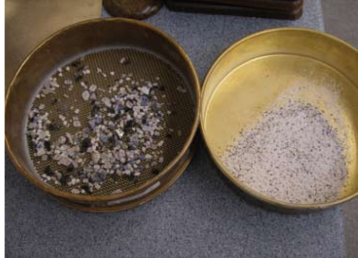
Figure Two: Example of sifted Blue Mosaic Terra Bella. For most patches, smaller particles (right) are used.

When drilling, make sure to bevel the edges of the patch area. This makes for a smoother transition between patch and existing gel coat. If the edge isn't beveled, a line might be visible around the patch area. Figure one shows several different sizes of patch area in Blue Mosaic Terra Bella.