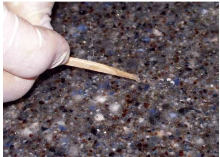
Figure Three: Filling the void carefully and avoiding spilling material on surrounding area.

To sift the matrix, a screen of any kind can be used making sure the aperture of openings is around 1.7 mm (Figure Two). Many kitchen strainers have openings close to this size. The large rocks may be hand separated, but this takes more time. Ultimately, the idea is to remove any rock that might stick