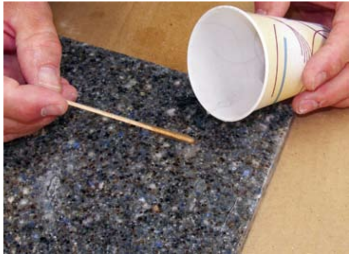
Figure Five: Apply minimal amount of gel coat over patch, slightly overlapping existing gel coat.

Step 8 Once the gel coat has fully cured over patch, begin sanding with a 400 grit sand paper, gradually working towards a finer grit. It is important to keep the sand paper level and apply equal pressure. If sanding by hand, a sanding block is highly recommended. Figure Six shows the finished part with no visible patches. Buff if necessary.