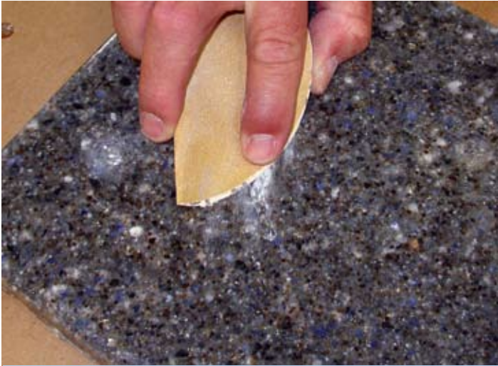
Figure Four: Sand away excess material that is above or even with gel coat.

Step 6 When cure is complete, it may be necessary to lightly sand away excess material that is discovered after cure. Using a fine grit sand paper, such as 240 grit, lightly sand the patch area if the surface feels rough (Figure Four). The more scratches left behind, the more sanding will be needed with finer grits to remove scratches.